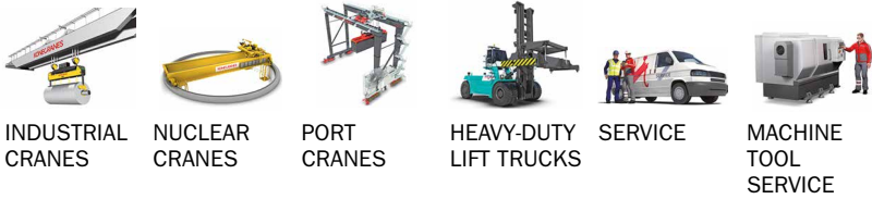
INDUSTRIAL CRANES NUCLEAR CRANES PORT CRANES HEAVY-DUTY LIFT TRUCKS SERVICE MACHINE TOOL SERVICE

As the production process relies so heavily on cranes, the reliable on-time delivery of spare parts is vital for a smooth operation. Chief Production Manager Victor D'Souza appreciates the timely and cost-effective deliveries. "They offer a wide range of delivery options for us, so we can choose the most convenient. Sometimes, we collect the parts from the Parts Distribution Center ourselves, but most often the delivery is arranged through a courier service," says D'Souza. "All in all, what sets Konecranes apart is that they proactively and consistently deliver quality products and service."